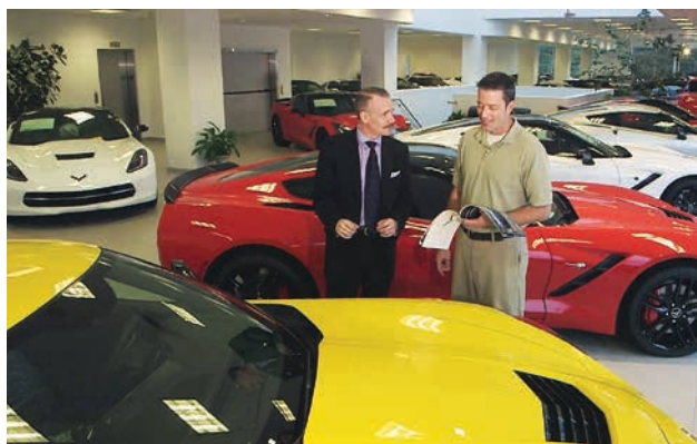
Now that the interior phase of the remodel is complete, MacMulkin's showroom displays a lineup of new vehicles.

As for the interior phase of the remodel, before the initial work began on the first floor, a temporary dust partition was set up