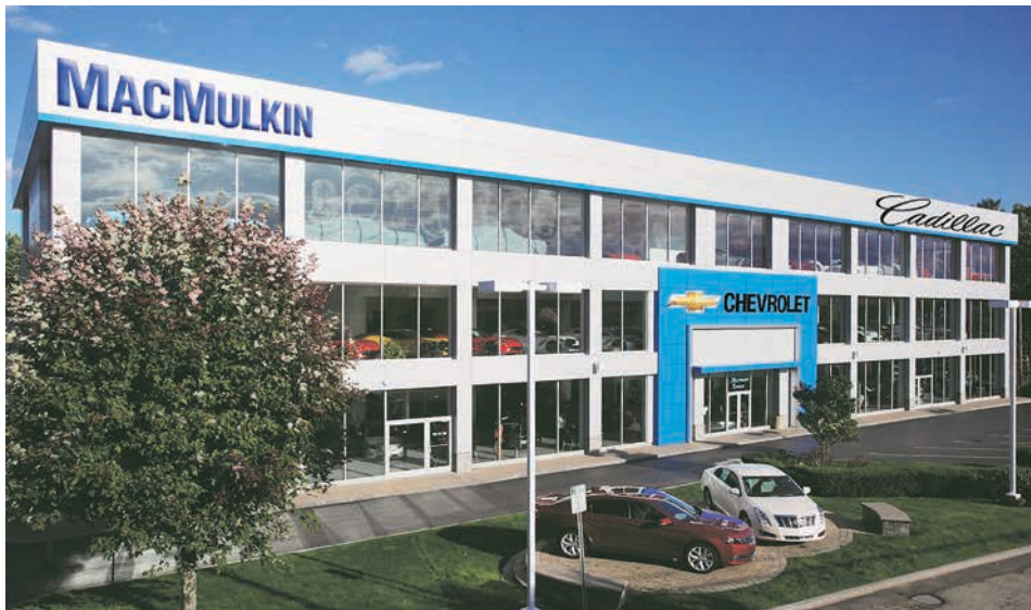
A view of the completed MacMulkin Chevrolet Cadillac dealership located in the New England Automotive Village, Nashua, N.H.

In keeping with the General Motors' latest dealer image transformation program, recent exterior and interior enhancements